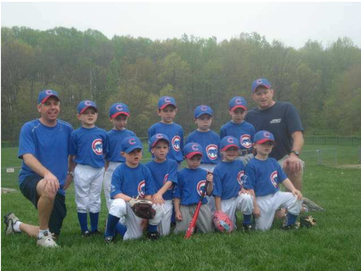
The Tee Ball League Cubbies, ready for big league action at Hickory Park.

Thanks to all who have submitted photos for the newsletter! Please continue to send them, along with the team name and division, to the newsletter editor.