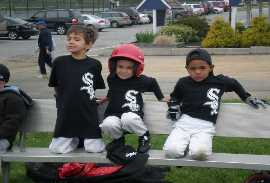
White Sox sluggers put on their best game faces.