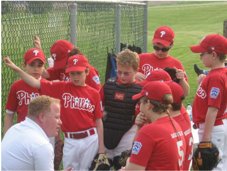
The Minor League Phillies talk pre-game strategy at West Vincent Field.