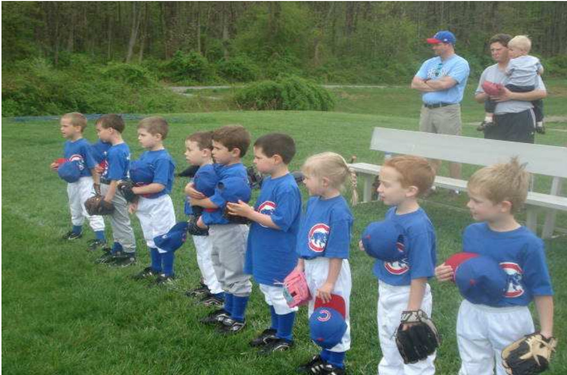
The T-Ball Cubs solemnly repeat the Little League Pledge prior to gametime on Saturday, April 26.